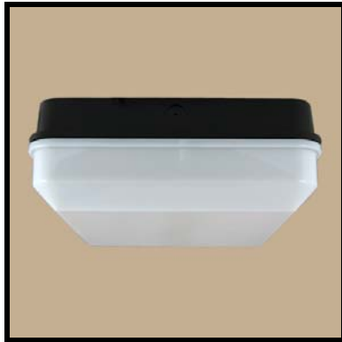
1400 Series Compact Fluorescent Polycarbonate