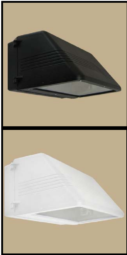
Compact Fluorescent Large Dark Sky Wall Pack 493 Series

LEADING THE INDUSTRY WITH QUALITY YOU CAN DEPEND ON