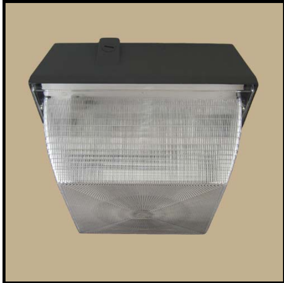
Compact Fluorescent Large Metal Canopy Fixture 300 Series

LEADING THE INDUSTRY WITH QUALITY YOU CAN DEPEND ON