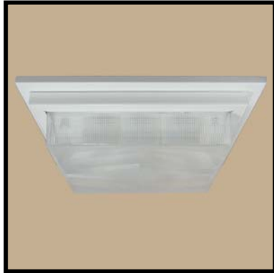
100 BSH LED Series – Cut Out Pan